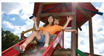
Children's playgrounds, youth facilities, ball courts, cycle tracks