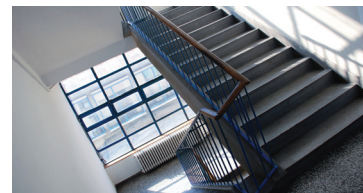
Internal works on housing property