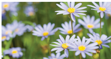
Parks, gardens and wildlife areas