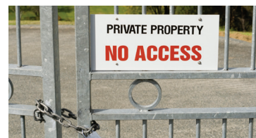
Works on private property