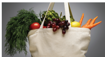
Reusable shopping bags